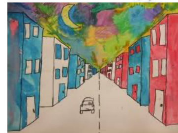
A cross on paper to create lines of perspective.